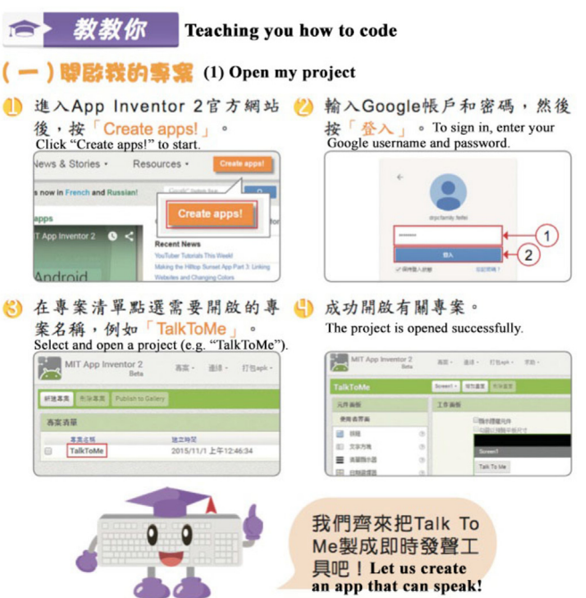
Fig. 3. Part of an e-book about programming.

For qualitative analysis, the interview data were audio-recorded and