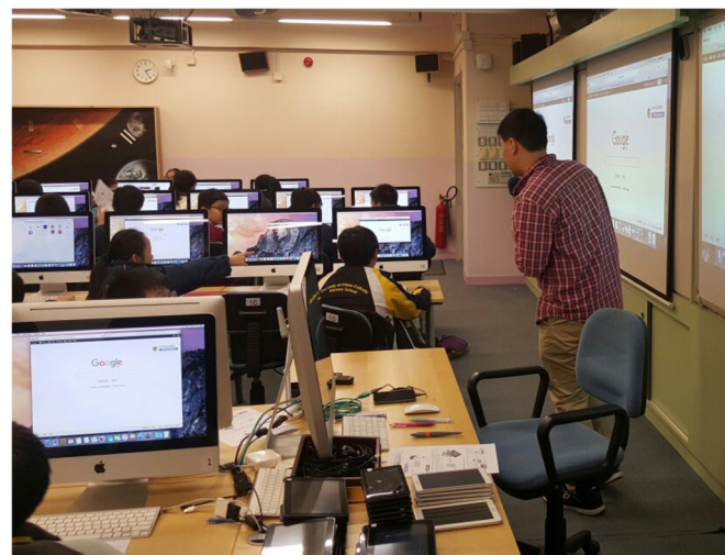
Fig. 2. The instructor's demonstration of how to build an app.

workshop, semi-structured group interviews were conducted with a sample of participants to collect further responses.